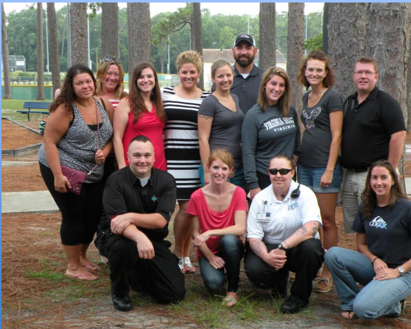
Some of the students in Wilmington gathered for a group photo at one of their social events.

I love my role as RIBN advisor: watching the students rise in their nursing journeys... and even getting a chance to work beside them in the hospital when they come in for clinical hours. It is a rewarding position and I know RIBN will just continue to expand as the news spreads throughout the region.